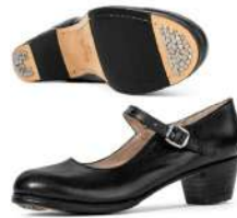
Black DG Leotard - Flamenco Skirt Tan Tights - Black Flamenco Shoes with nails